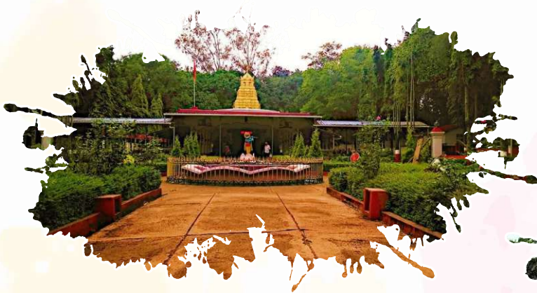
Military Mahadev Temple