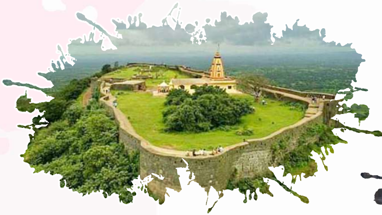
Rajhansgarh Yellur Fort